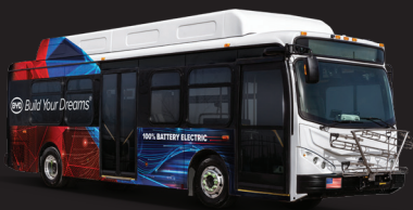
K7M | 30' TRANSIT

The American-built all-electric BYD bus is the essence of reliability and high-quality. Its unique iron-phosphate battery is the safest in the industry and comes with a standard 12-year warranty, ensuring that you never have to pay for the battery replacement during the service life of the bus.