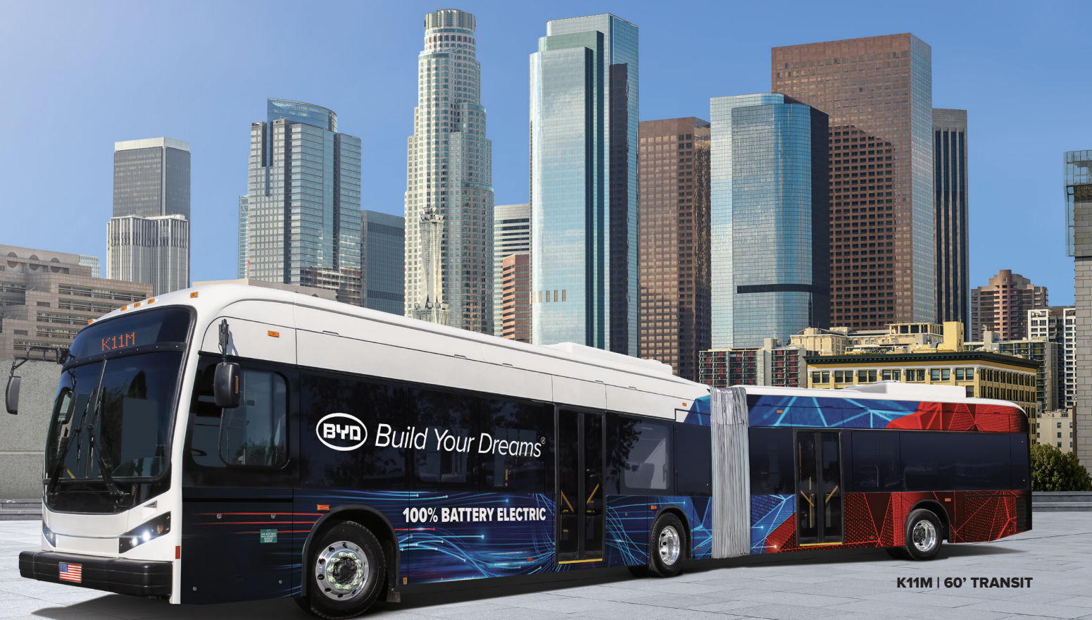
K11M | 60' TRANSIT