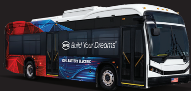
K8M | 35' TRANSIT