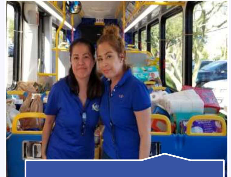
Fill the Bus