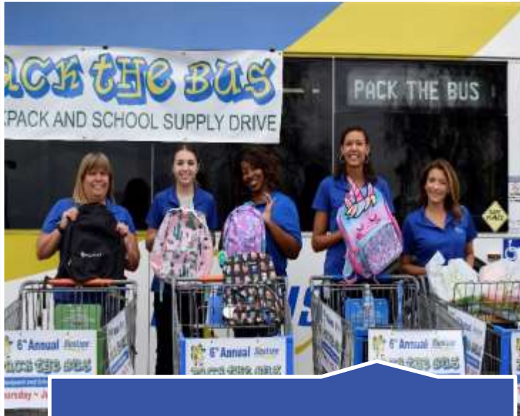
Pack the Bus