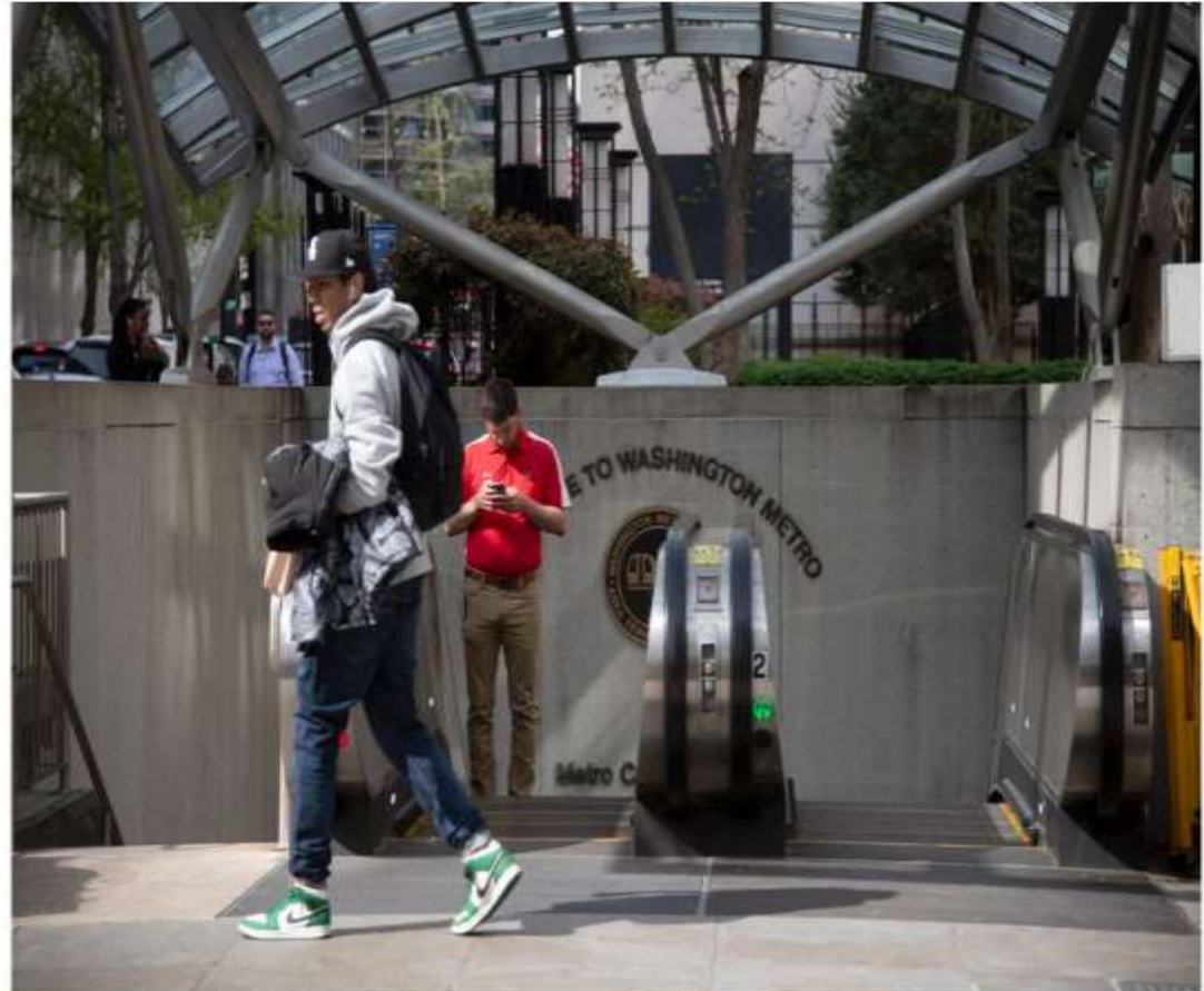
Metro ridership is posting increases.