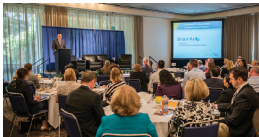
SPRING LEGISLATIVE CONFERENCE