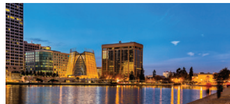
The location of the 2016 Annual Fall Conference & Expo is Oakland, California.

Alameda-Contra Costa Transit District (AC Transit) is an innovative, modern bus system, owned by the public of the East Bay. In the more than half century that AC Transit has been in operation, the District has expanded its service area considerably, expanded the types of services it offers, and has become a leader in the use of alternative fuels.