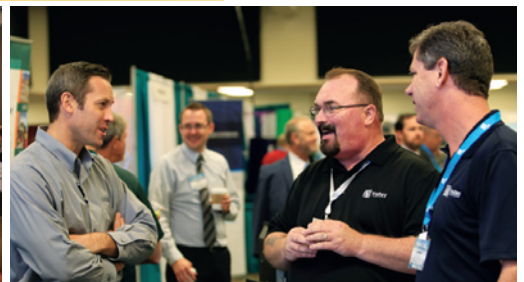
FALL CONFERENCE & EXPO